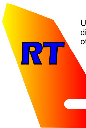
Fin right side