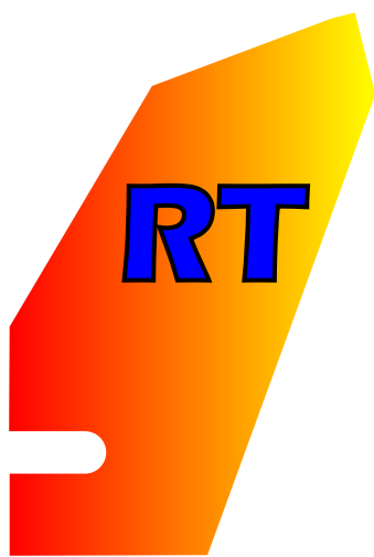
Fin left side

Use these braking scale blanks to draw in distance lines. It is a good idea to have distance lines in both standard and metric. You can attach one to the top and the other one on the bottom of the front plate.