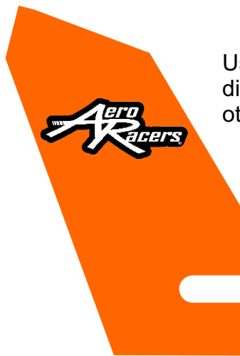
Fin right side